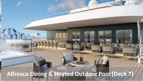
Alfresco Dining & Heated Outdoor Pool (Deck 7)