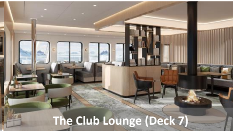
The Club Lounge (Deck 7)