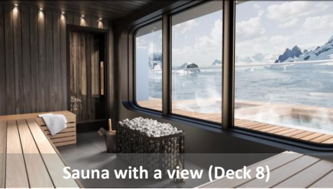
Sauna with a view (Deck 8)