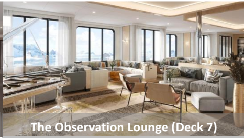
The Observation Lounge (Deck 7)